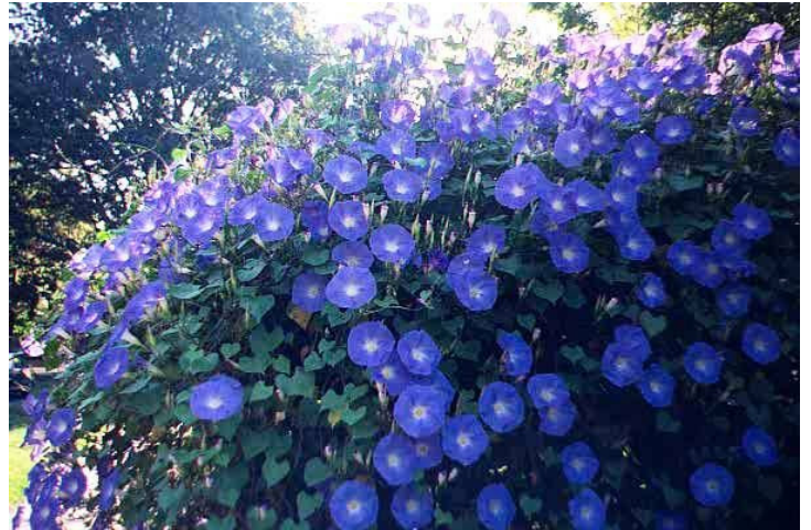
September Flower: Morning Glory, Aster September Birthstone: Sapphire, Opals

Are you a new member? Would you like to update the photo you now have in the DAGC Directory? I will be taking photographs of any members who want or need one at the September meeting.